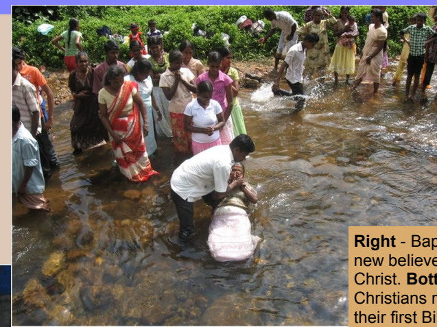
Right - Baptism of new believers in Christ. Bottom - New Christians receiving their first Bible.